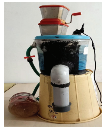
Figure 1: Prototype of Biogas Digester.

The entire components plastic tank, valves, pipes, pressure gauges are assembled tightly with the help of m-seal as shown in Fig 1.